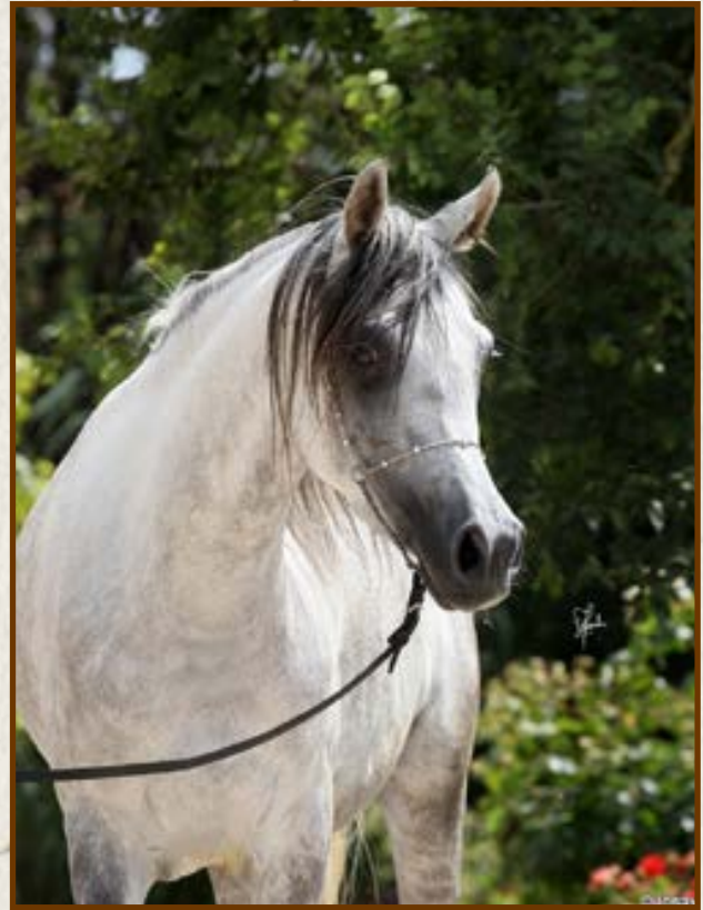
La Diva Nooa (Sahib x CD Anasta) went to DG Arabians Albania.