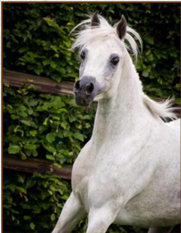
Serene Isis (Ibn Nejdy x Serene Carima by Salaa El Dine).