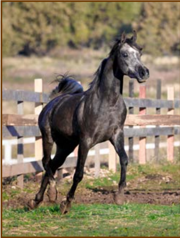
La Diva Omar (Ansata Nile-Echo x CD Anasta) went to DG Arabians Albania.