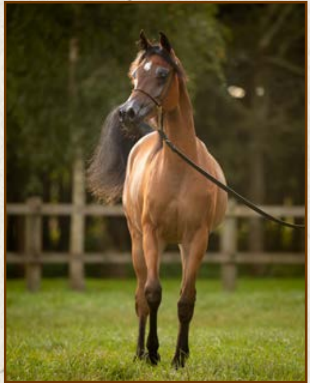
GJ Amira Deenaa (Naseem Al Rashediah x Pashmina by Salaa I Dine).