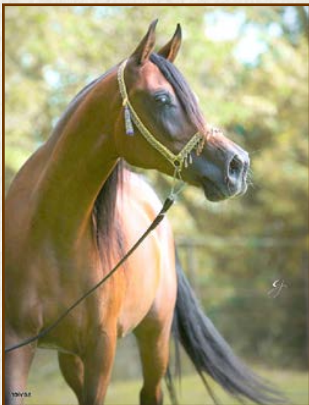
CD Anasta (Safeen x Qublah).