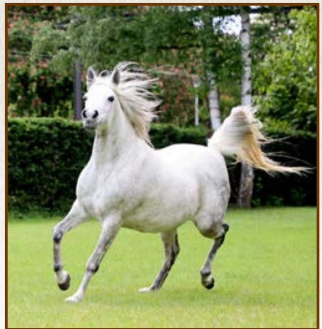
La Diva Nile-La (Ansata Nile-Echo x CD Anasta).