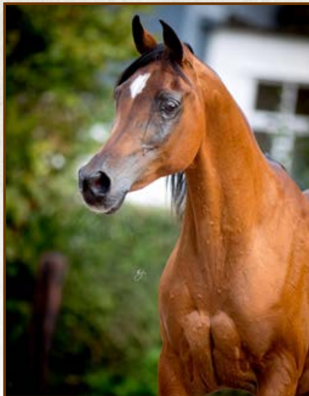
Pashmina (Salaa El Dine x A Little Passion).