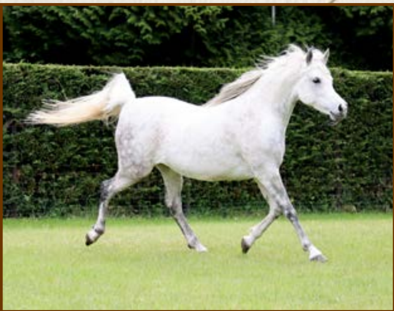
La Diva Nile-La (Ansata Nile-Echo x CD Anasta).