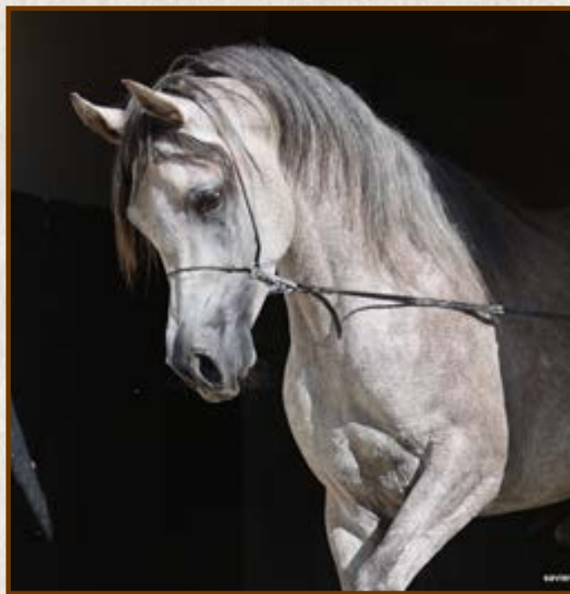
La Diva Nadeem (Ansata Nile-Echo x CD Anasta ) went to Pakistan.