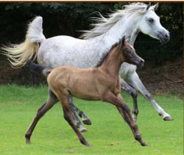
La Diva Noor with her daughter La Diva Sahida (Sahib x la Diva Noor).