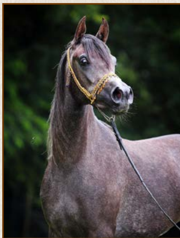
La Diva Safina (Ansata Nile-Echo x CD Anasta) went to Saudi Arabia.