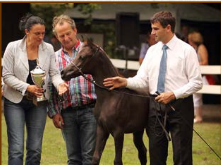
La Diva Nile-La (Ansata Nile-Echo x CD Anasta) as foal at the Egyptian Event Lanaken in 2012.