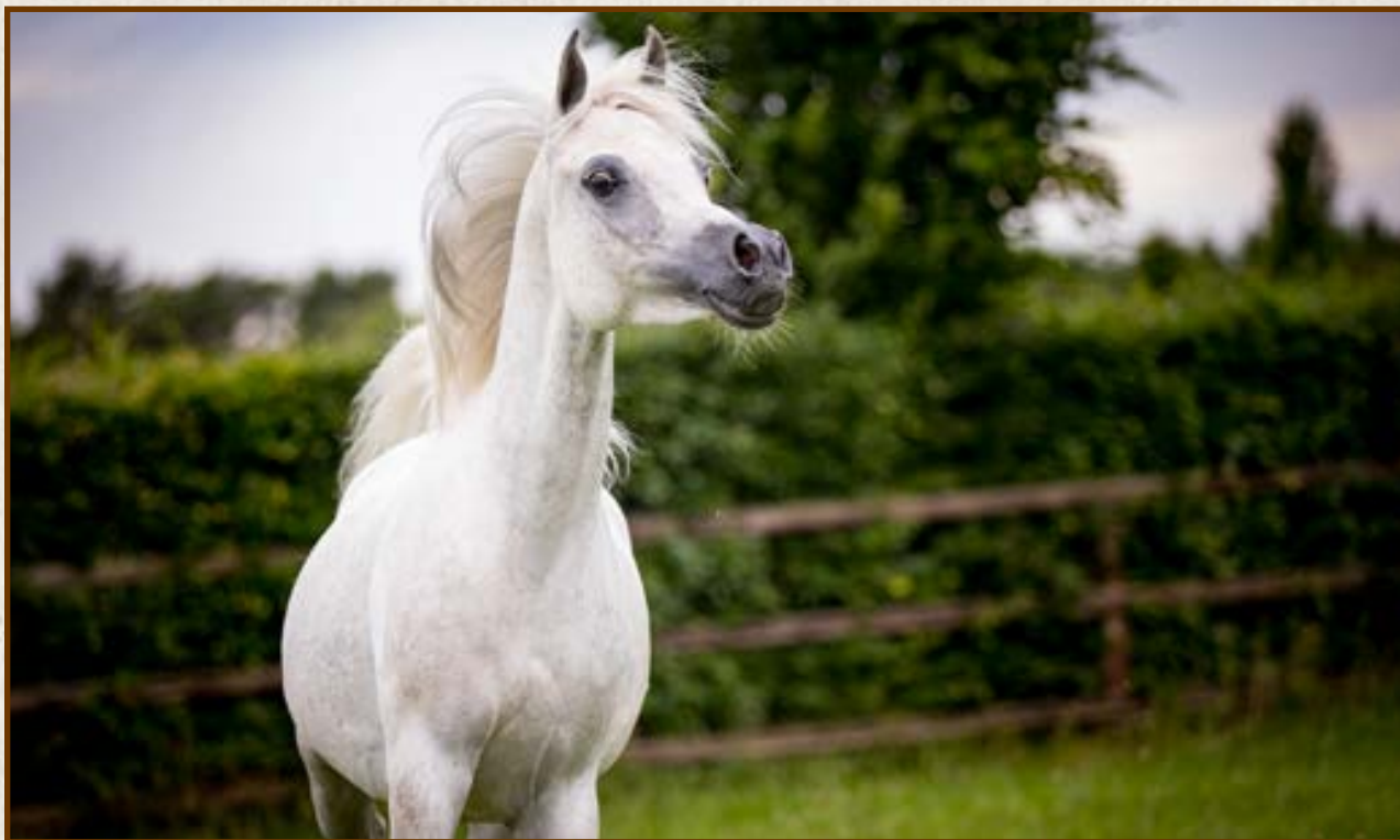
Serene Isis (Ibn Nejdy x Serene Carima by Salaa El Dine). She is in foal to Al Ghazi Al Rashediah.