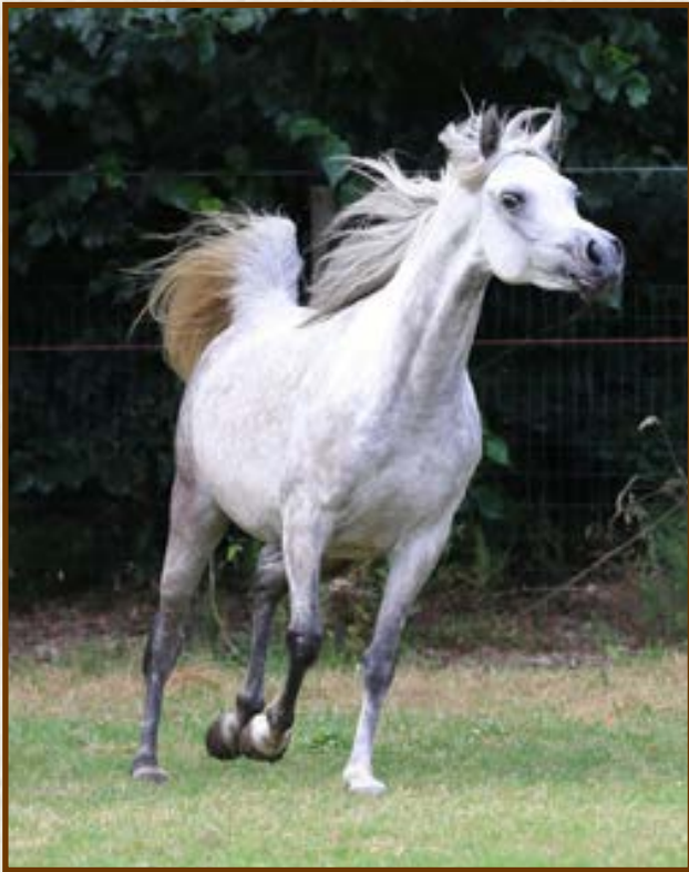
La Diva Noor (Ansata Nile-Echo x CD Anasta) went to Al Hayal Stud Israel.